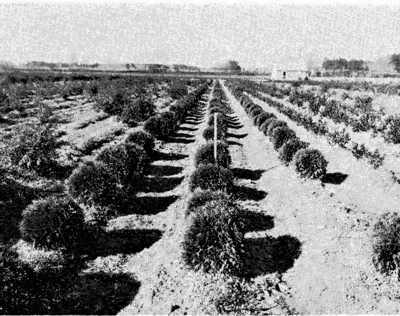
Thuja occidentalis globosa , with Berberis Juliana at left. Photo Dec. 18, 1957.